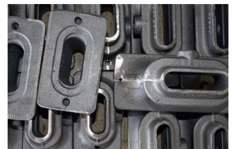
Deburring of iron casting workpieces