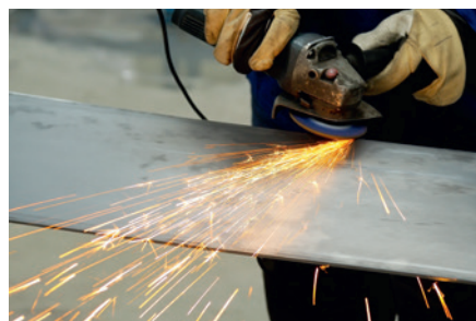
Triming of steel plates for welding